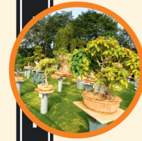
VAMAN - BONSAI GARDEN