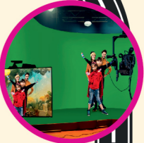
MOTION CAPTURE & VIRTUAL SHOOT